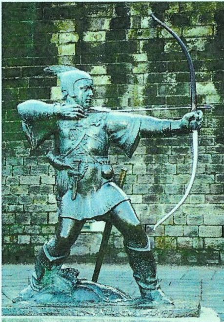
Statue of Robin Hood in Nottingham

Robin Hood ... how can we say these words without hearing the old familiar tune?