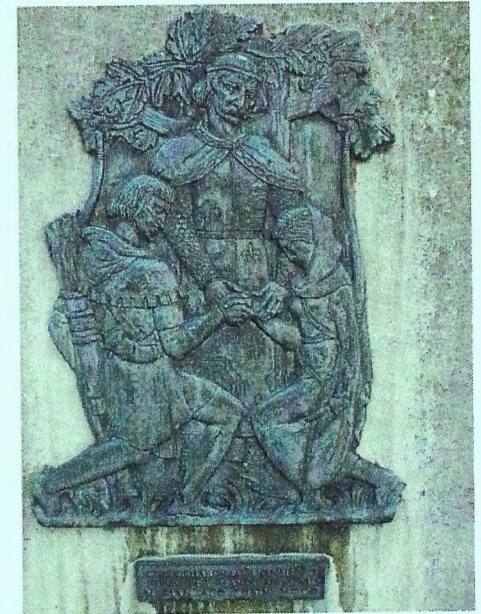
A plaque outside Nottingham Castle depicting King Richard marrying Robin and Marian