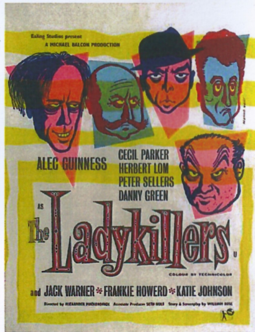
Original film poster by Reginald Mount

As this quote suggests, Linehan's version of The Ladykillers is not simply a recreation of the film, it is very much an adaptation. What the writer and original director, Sean Foley, have done is to take the essentials of the original and then apply their own interpretation to that framework. But don't panic too much; Linehan also observed, "The film was great, and we all knew that, but there were enough possibilities to have fun with it, but also stay true to the film's original intentions".