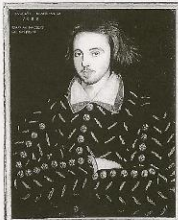
An anonymous portrait in Corpus Christi College, Cambridge believed to show Christopher Marlowe.

Another warrant was issued for Marlowe's arrest on 18 May 1593. No reason for it was given, though it was thought to be connected to allegations of blasphemy – a manuscript believed to have been written by Marlowe was said to contain 'vile heretical conceipts'. He was brought before the Privy Council for questioning on 20 May, after which he had to report to them daily. Ten days later, he was stabbed to death by Ingram Frizer, supposedly in a drunken brawl. Whether the stabbing was connected to his arrest has never been resolved.