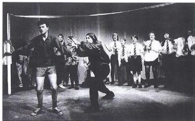
Gregory's Girl (1991) – The First Youth Theatre Production

It was early summer 1991. A notice was sent out to Youth Theatre members announcing an audition for the first ever Youth Theatre production, Gregory's Girl . The Young Questors was founded way back in 1954 but until this point had never mounted its own fully staged production. When required, individuals had always appeared in the Questors main-stage shows and in the early years groups had participated in local drama competitions with some success, but this production was the start of something new.