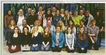
THE MAIN CAST