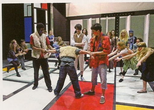
QYT: Brave New World

Aged between 11 and 16 – the one and a half hour classes during the weekday evening cover role-playing improvisations and acting exercises to help develop drama skills and lay the foundation for theatre skills.