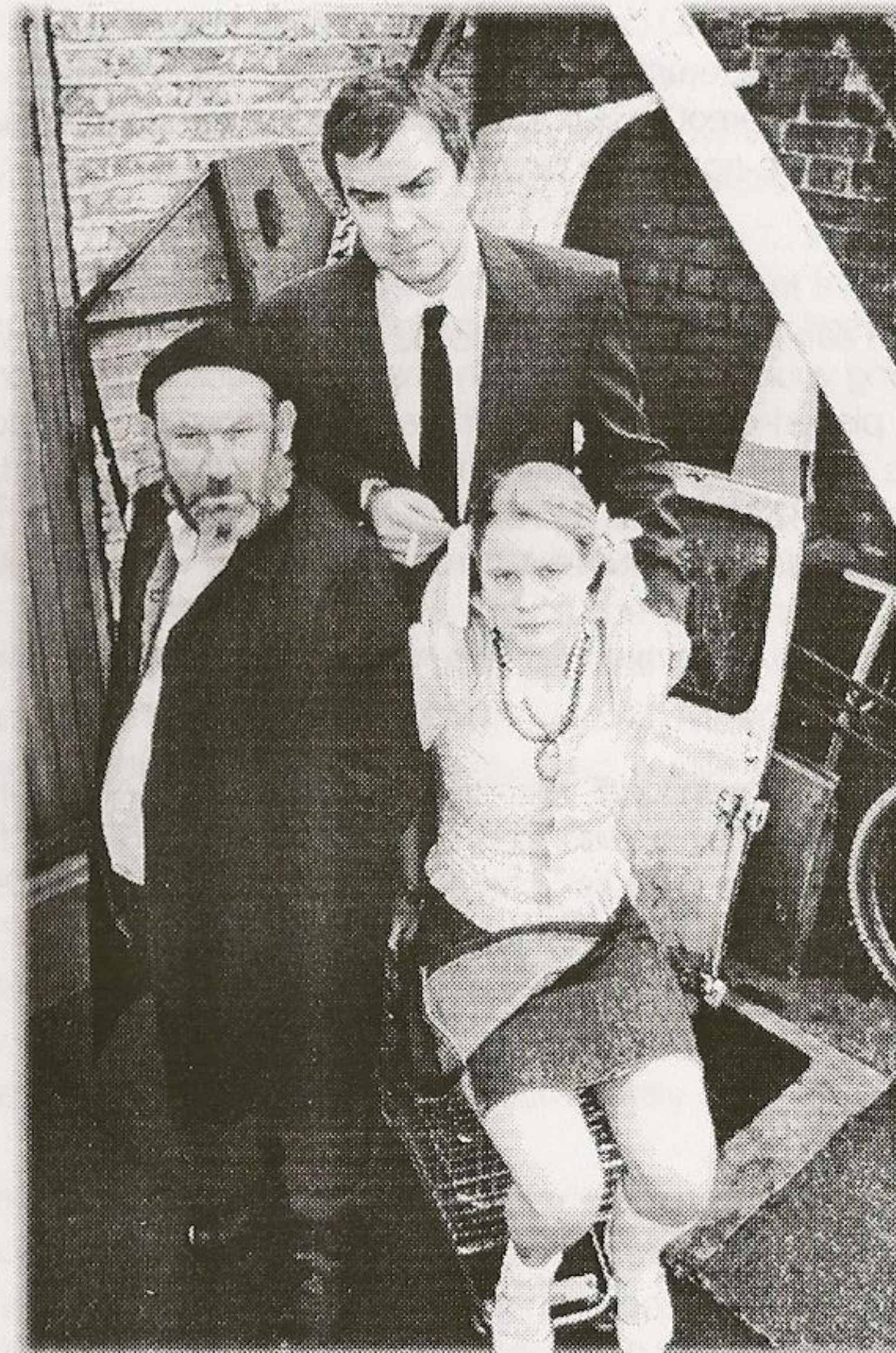
Dame Judi Dench President of The Questors Theatre