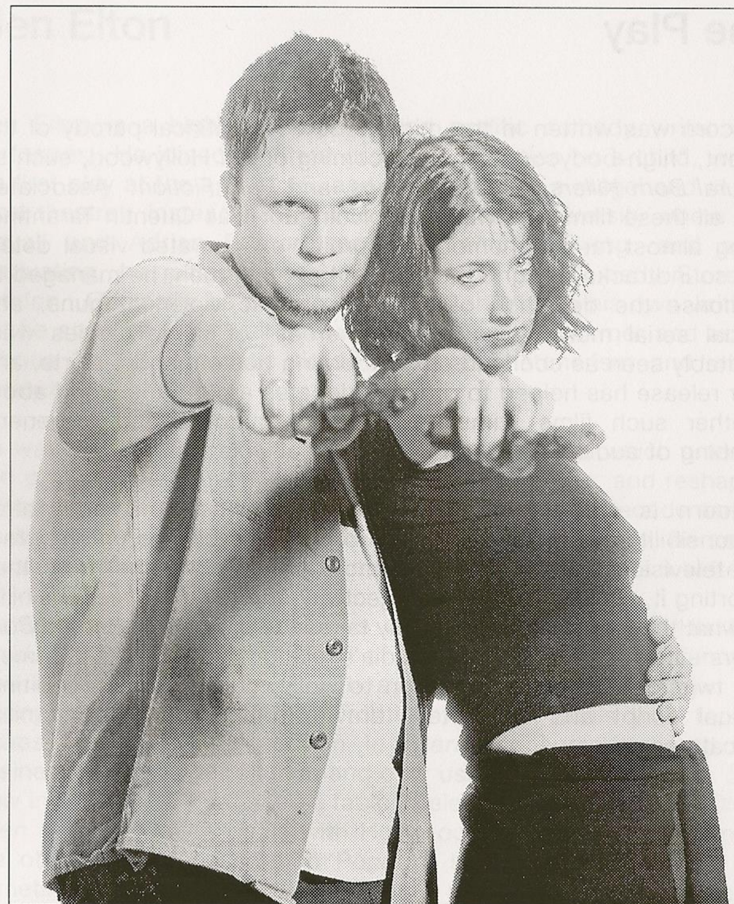
Dame Judi Dench President of The Questors Theatre