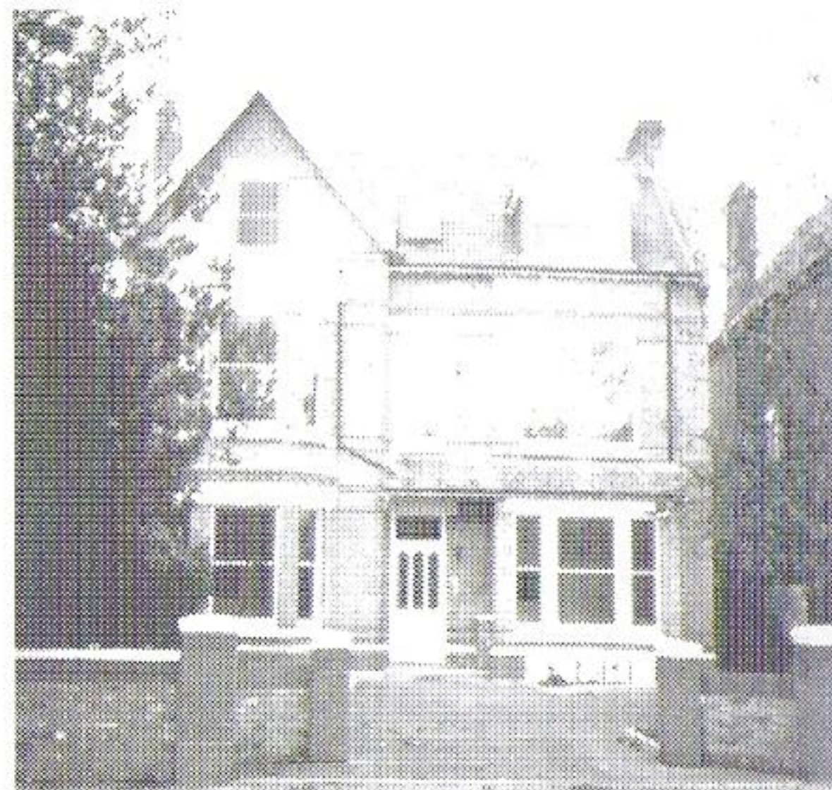
MATTOCK LANE, EALING, W.5

Just moments walk along Mattock Lane from this Theatre is "Cherry Tree House". A stylish and elegant conversion of this fine property into Five individual Apartments. The standard of workmanship and faithful retention of the property's character make this one of the best schemes of this type on the market at present. All with 2 or 3 Bedrooms, some with private gardens, and including a stunning Penthouse. Prices from £129,500 Leasehold. SOLE AGENTS. SINTON ANDREWS - 8 Springbridge Road, Ealing, W5 2AA Tel. 01-566 1990 and 84 Northfield Avenue, Ealing, W13 9RR Tel. 01-840 5151.