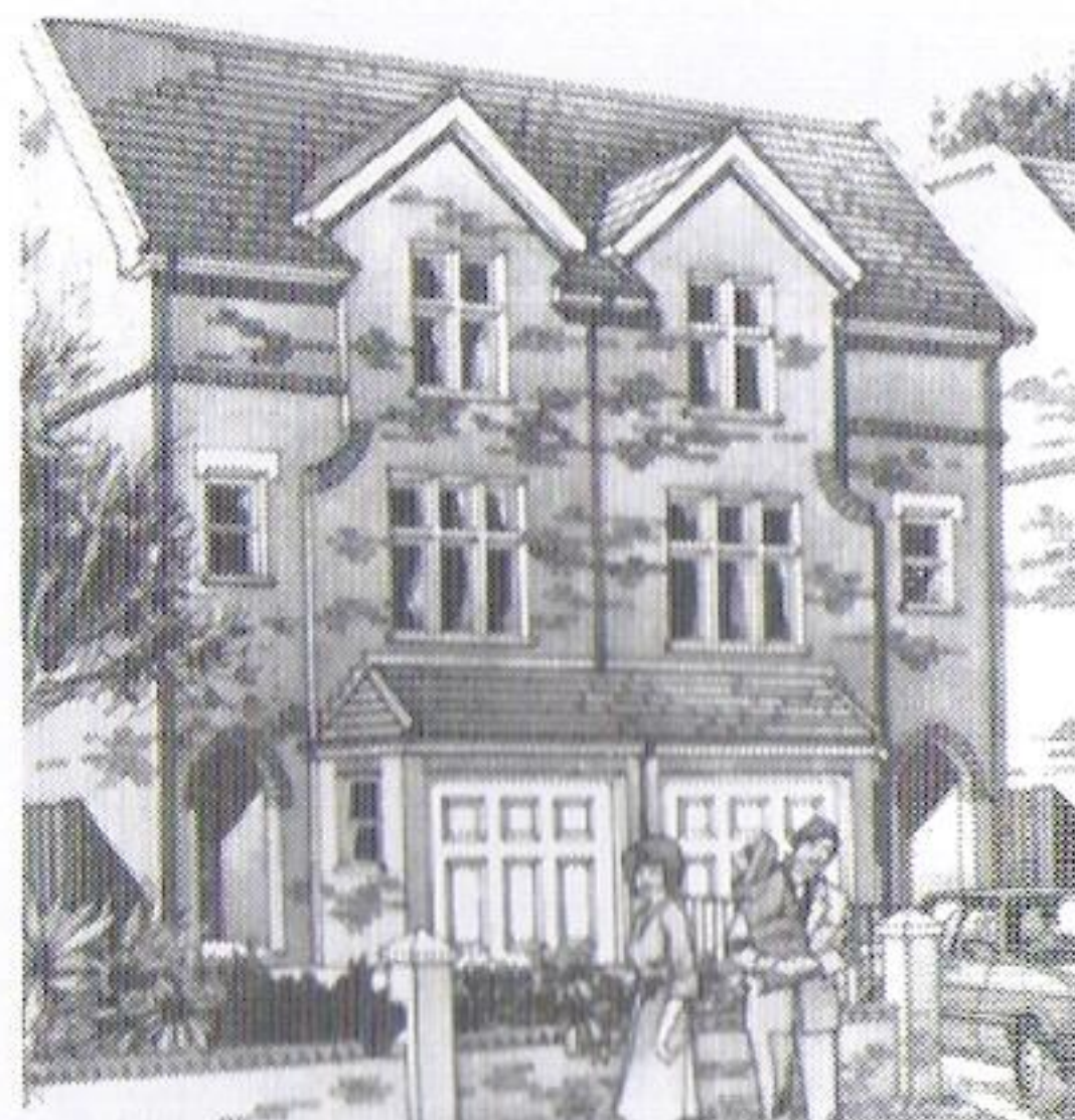
WOODVILLE ROAD, EALING, W.5

ALSO AT: 176 KING ST. HAMMERSMITH W6 0RA. Tel. 01-846 9611